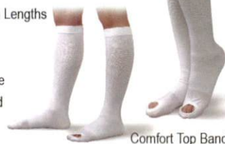
Comfort Top Band